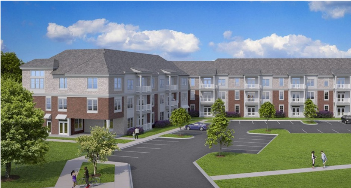
Horner Apartments 149 Units

LISC Loan: $12,900,000 Predevelopment loan. A $5,900,000 participation was sold to the Nonprofit Finance Fund.